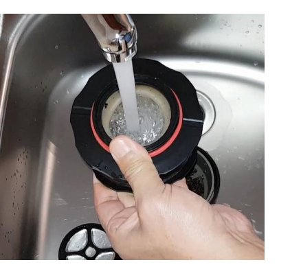
Put 1/4 water while squeezing bellows