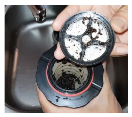
Open the Filter after press/squeeze