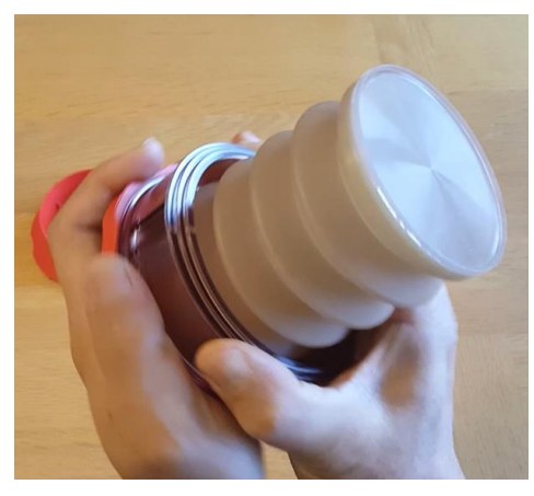
Screw up Press Guide and Pulling Plate, keep them tight...