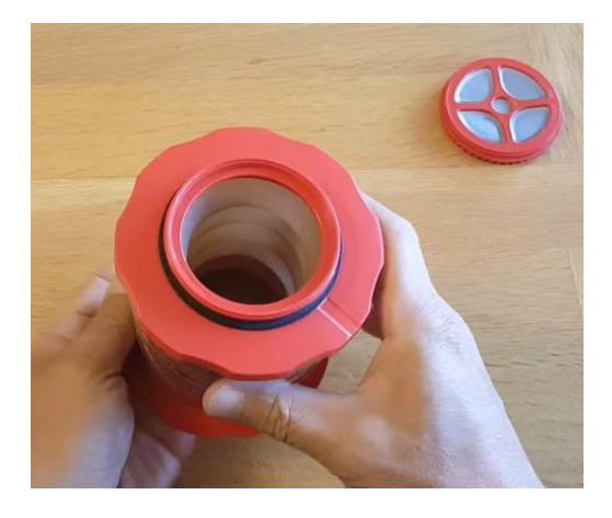
Ready to brew!