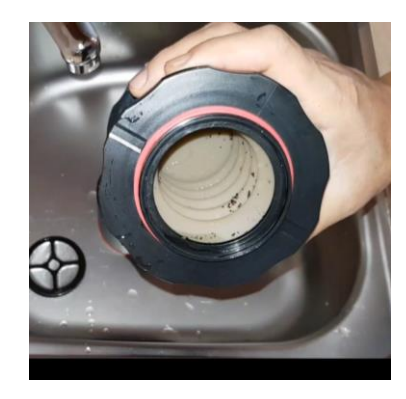
(residual still remained)