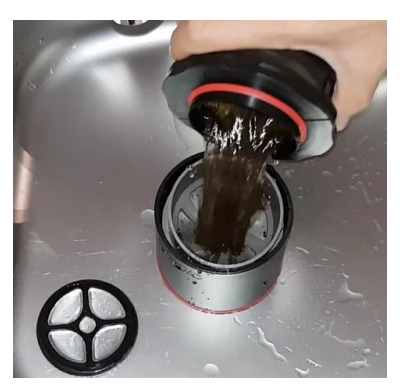
Shake, pour out while water being swirled