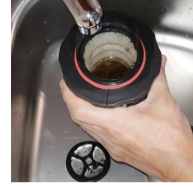
Fill up half with tap water, close Filter