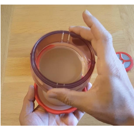
Align Press Guide into Pulling Plate