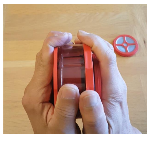
Check Press Guide & Pulling Plate and keep them tight again.