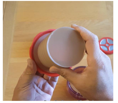
Put Bellows Chamber at the centre of Pulling Plate