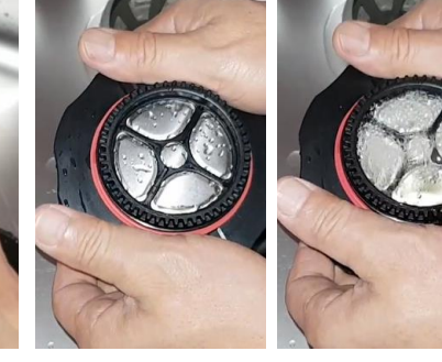
Clean micro-Filter with pump action