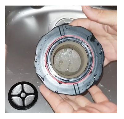
Filter and Chamber perfectly cleaned