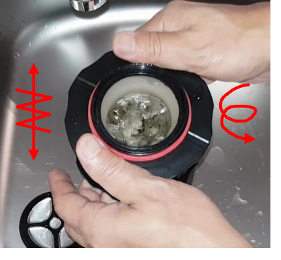
Slow pump and swirl action brings residual to bottom