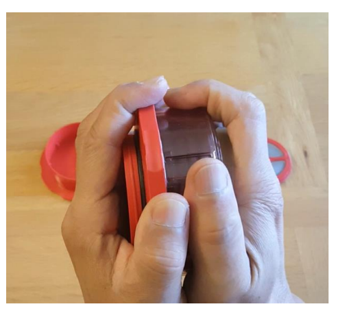
And keep them tight again to prevent any water leaks.